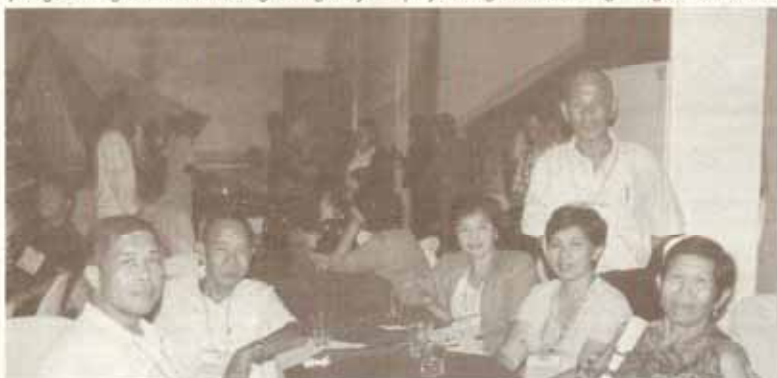
National Conference on Tricycle Transportation Development June 25-30, 2006 at Iloilo Grand Hotel, Iloilo City Theme: "Working Together for a Better Local Transportation."

Tinatayang limang milyong piso ang halaga ng mga ari-arian ang natupok sa nasabing sunog. Magugunitang ibinalik din ng mga bumbero ng Valenzuela ang nahaharap na P500,000 na pagmamay-ari ng Lins Magic Clean Corporation noong nasunog ang pagawaan ng naturang kumpariya noong Marso sa Barangay Canamay.