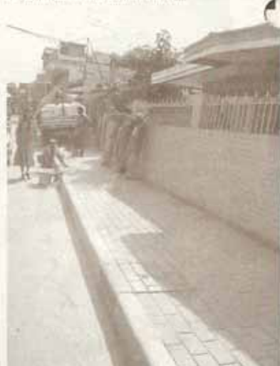
Buhayin ang Sidewalk Project in Gen. T. de Leon.

The intensive road and sidewalk rehabilitation projects, including the improvement of drainage systems, which amount to Php 200 Million, come from the City Government's General Fund and loan.