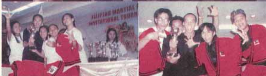
The Virulent Tigers Armis Team of the Pamantasan ng Lungsod ng Valenzuela bags the trophy as the over-all champion of The Filipino Martial Arts Invitational Tournament at the Philippine Columbian Association, Paco, Manila on July 22, 2006