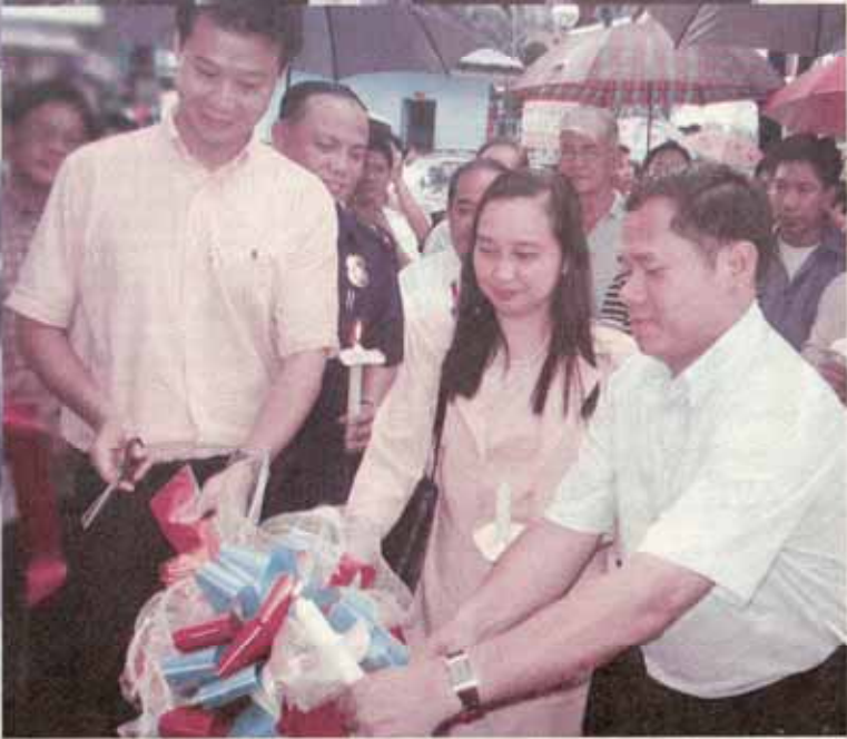
Mayor WIN turns-over free notebooks and books to all public school students in the City as part of the VC Global Program of the City Government.