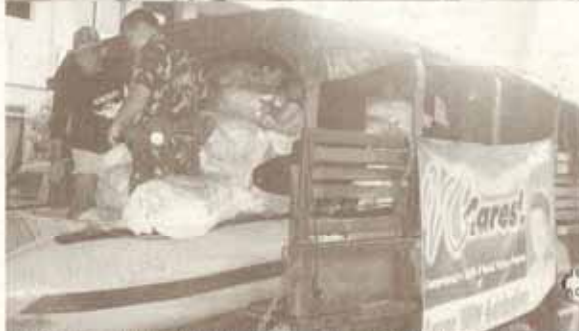
(Top Photo) Mayor WIN talks with residents of Barangay Wawang Pulo after delivering relief goods at the height of typhoon Glenda. (Middle Photo) City employees work 24 hours to repack relief goods, while members of the Philippine Marines assist in the delivery of goods to affected families (bottom photo) in 17 barangays submerged due to torrential rains.