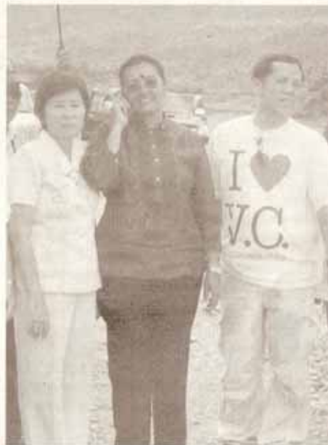
Governor Rosette Lerias, in a phone conversation with Mayor WIN.

moments like this, we need to tear down whatever physical, social or even political boundaries that separate us into groups