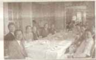
Valenzuela City Officials with Bucheon City, South Korea delegates

Currently, he heads in facilitating talks and cooperative