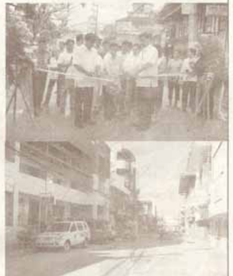
Naayos na ang dating lubak-lubak at bahaling bahagi ng M.H. Del Pilar, sa harap ng Polo Emergency Hospital, Barangay Poblacion.

Ilan sa mga natapos na ay ang road rehabilitation project sa M.H Del Pilar road (Poblacion).