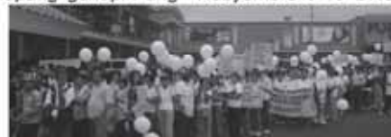
Sumama sa rally ang Valenzuela United Lions Club kasama ang mascot ni Kapitan VADAC

Kasama rito ang mga estudyante, mga guro, mga pulis, REX Ladies, WIN Mothers, Rotary Club, Lions Club, mga magulang, mga pastor, boiscout at girl scout, barangay tanod, Traffic Enforcers at mga civic organization; upang ganapin ang Nobyembre 9-15 DRUG