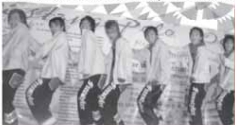
Free Styler, candidate of Group Dance Competition