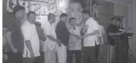
Si Mayor WIN tinanggap ang parangal mula sa NAPOLCOM

Sa CAMANAVA Greats Awarding Ceremony na ginanap sa Valenzuela Convention Center noong ika-24 ng Oktubre, personal na tinanggap ni Mayor WIN ang Plaque of Commendation para sa kanyang walang pag-iimbot na dedikasyon at commitment sa isang tahimik at maayos na komunidad.