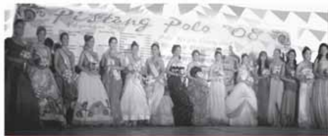
The 16 Sagalihan Grand Final Candidates of Pistang Polo '08

for their passionate and pitch-perfect rendition of Mariah Carey's Vision of Love. All-adolescent band Diegs from Brgy. Polo came in second receiving P7,000 and Bossa-Jazz-influenced PM Zone band from Brgy. Marulas, 3rd with P5,000. ■