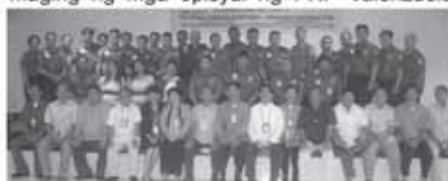
Mga pulis na nagtapos noong Oktubre 23, at mga pastor ng VCMASCON na nagturo ng Purpose Driven Life.

Lunes, 8:00-9:00 ng umaga, na dinadaluhan maging ng mga opisyal ng PNP Valenzuela.